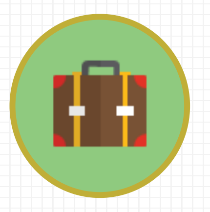
First day arrival

Independent travellers are responsible to meet up with the NCE group in Italy. Location TBC.