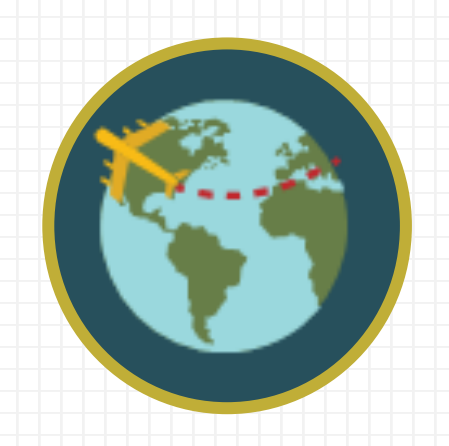
NCE Group Fight Program

Group should plan to arrive at the airport 3 hours before departure time and meet NCE Staff coaches. Location TBC.